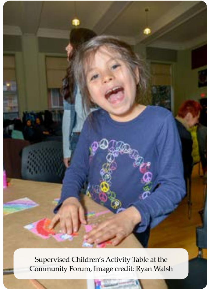
Supervised Children's Activity Table at the Community Forum

While a limitation in the research is a gap in current lived experience, there were multiple participants who shared their knowledge and experiences based on their past lived experiences of incarceration 12 .