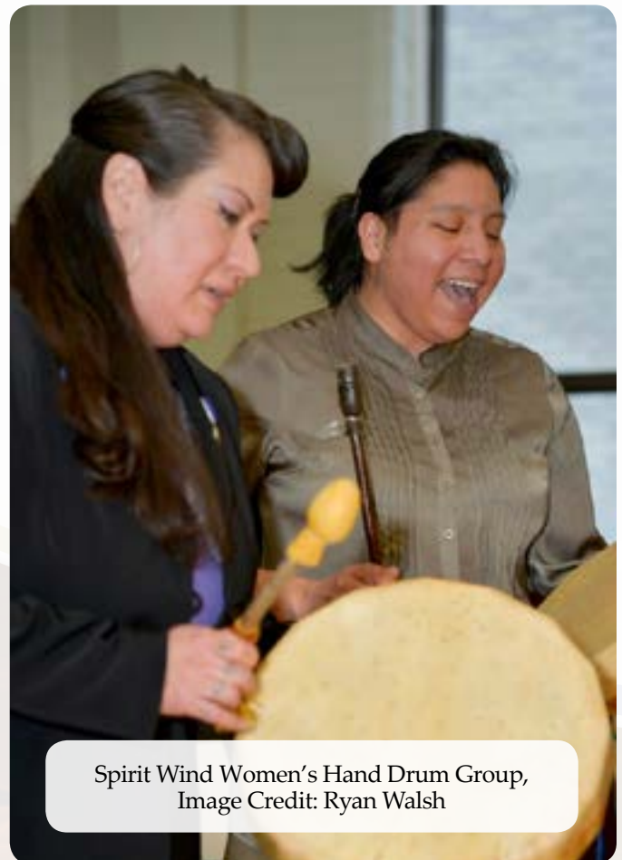
Spirit Wind Women's Hand Drum Group

It should be noted that a number of offenders indicated that they had not been interested in their traditions prior to coming to the lodges. However, the exposure to their traditions and the Elders was very positive for these offenders and resulted in further interest in both their culture and healing. This is important to keep in mind when determining which offenders may succeed at Healing Lodges.