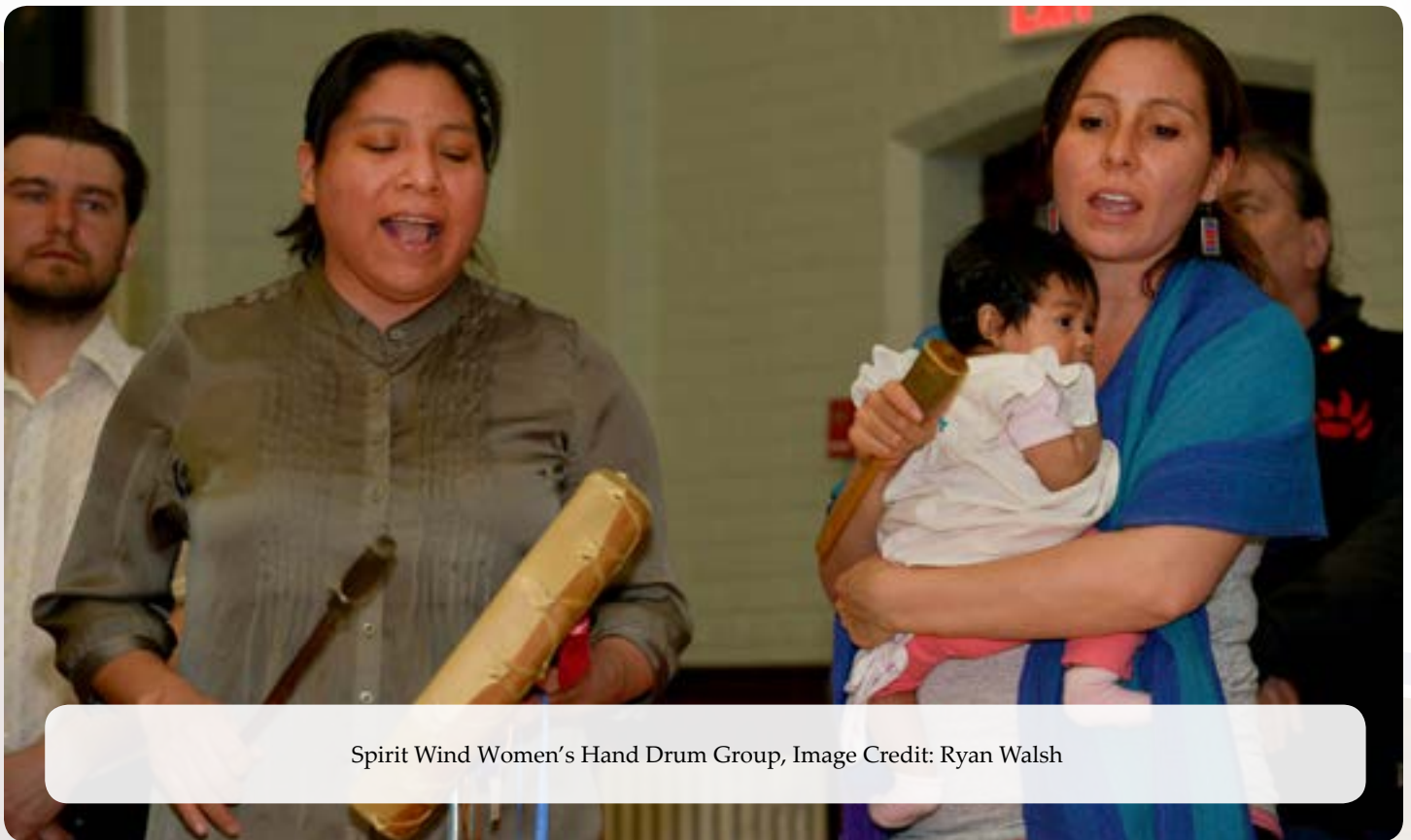
Spirit Wind Women's Hand Drum Group