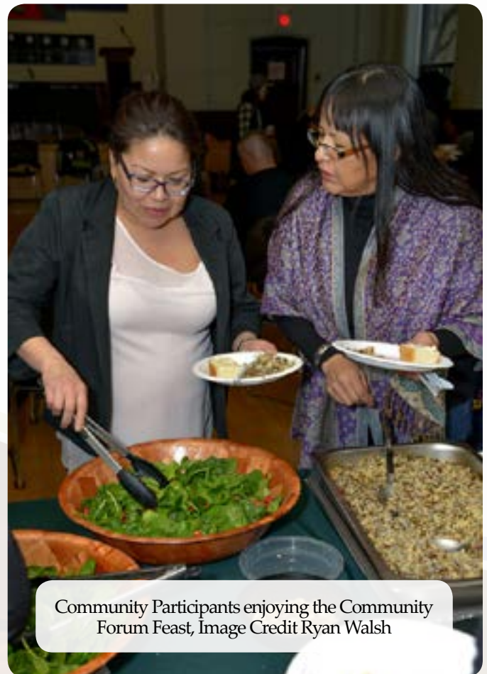
Community Participants enjoying the Community Forum Feast